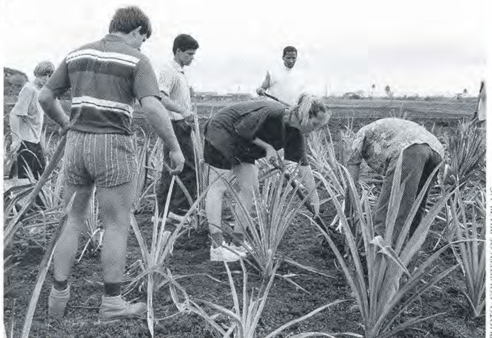
Unificationists from around the world work in the fields at the New Hope Farm in Campo Grande, Brazil.

You may feel a little bit skeptical about all I have explained, but just follow me and see what happens. Even more so, you have to push me to promote this project and stand on the front-line. Do you understand? (Yes.) If American people as Cain and Unificationists as Abel combine into one, everything will be completed from a conditional viewpoint. Stand up and shout out, "Let's go to South America!" (Let's go to South America!) Mansei! Mansei! Mansei! God bless you. (God bless you, Father.) ■■