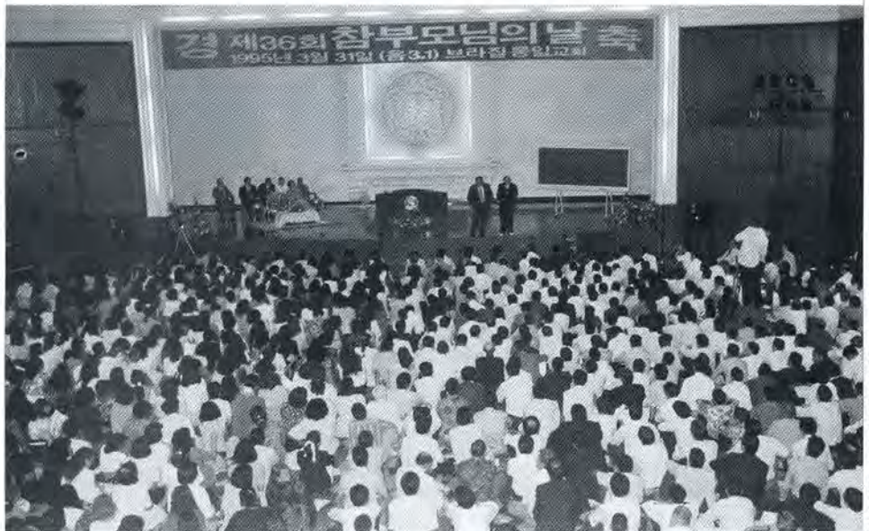
Father speaking at the 10 a.m. speech on the 36th True Parents' Day celebration in Brazil.