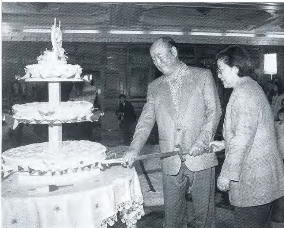
Father and Mother cut the celebration cake upon arriving at the Brazil national headquarters, March 11, 1995.

The point most emphasized by Father was the need to restore absolute faith, absolute love, and absolute obedience. The failure of Adam and Eve was primarily in these three points. For blessed fami-