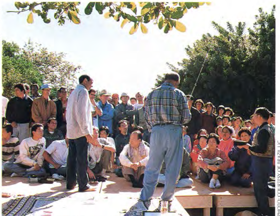
Father teaches fishing to the international leaders at the New Hope Farm in Brazil.

a) The original family lost the foundation of loving the creation, loving humankind and loving God. As Subject, God did everything. He loved the earth, all created